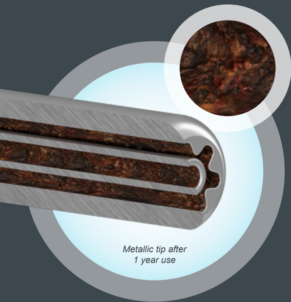
Metallic tip after 1 year use

It is impossible to clean correctly the inside of reusable tips due to the presence of biofilm. (1)