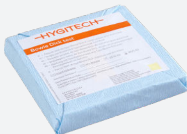
Bowie Dick Tests