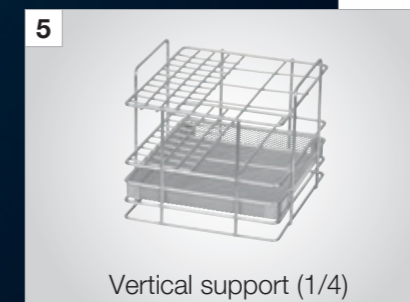
Vertical support (1/4)