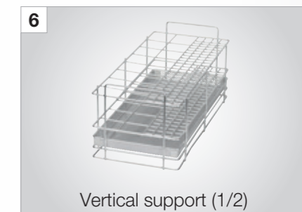
Vertical support (1/2)