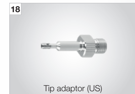
Tip adaptor (US)