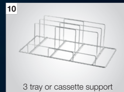
3 tray or cassette support