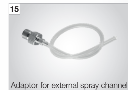
Adaptor for external spray channel