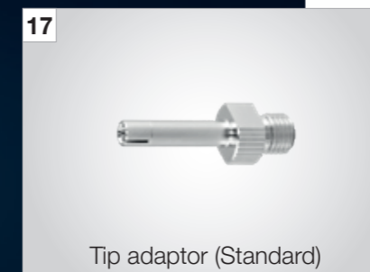
Tip adaptor (Standard)