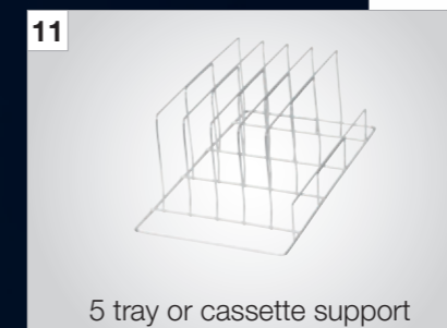
5 tray or cassette support