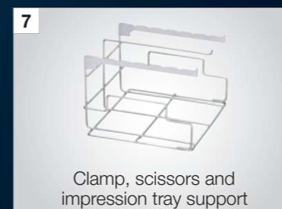
Clamp, scissors and impression tray support