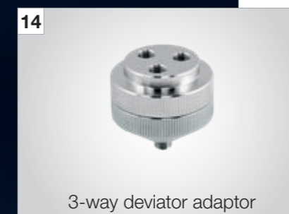
3-way deviator adaptor