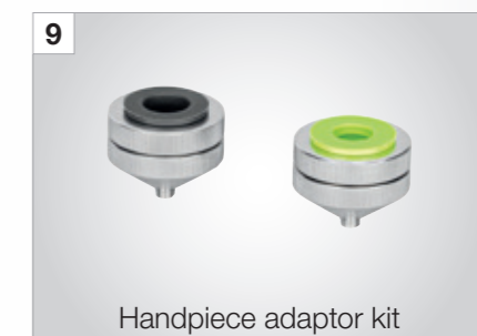
Handpiece adaptor kit