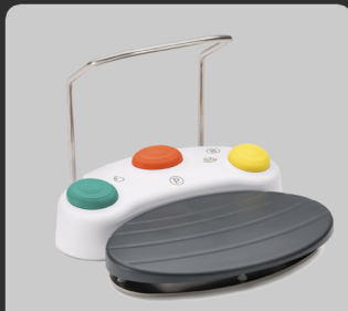
Wireless foot control for controlling multiple W&H devices

Includes FREE set up, commissioning & training worth £216