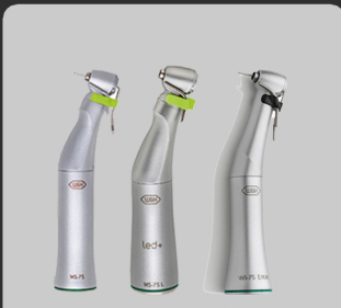
Handpiece Bundles Available with a WS-75, WS-75L, WI-75