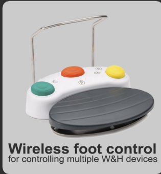
Wireless foot control for controlling multiple W&H devices

Setup, Training & commissioning worth £216* COMPLETELY FREE!