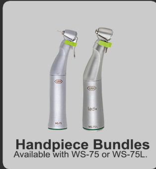
Handpiece Bundles Available with WS-75 or WS-75L.