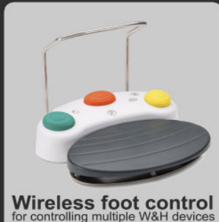
Wireless foot control for controlling multiple W&H devices

Setup, Training & commissioning worth £216* COMPLETELY FREE!