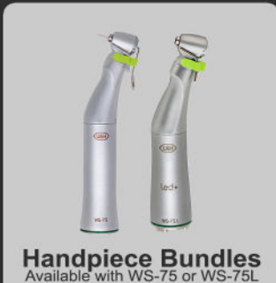
Handpiece Bundles Available with WS-75 or WS-75L